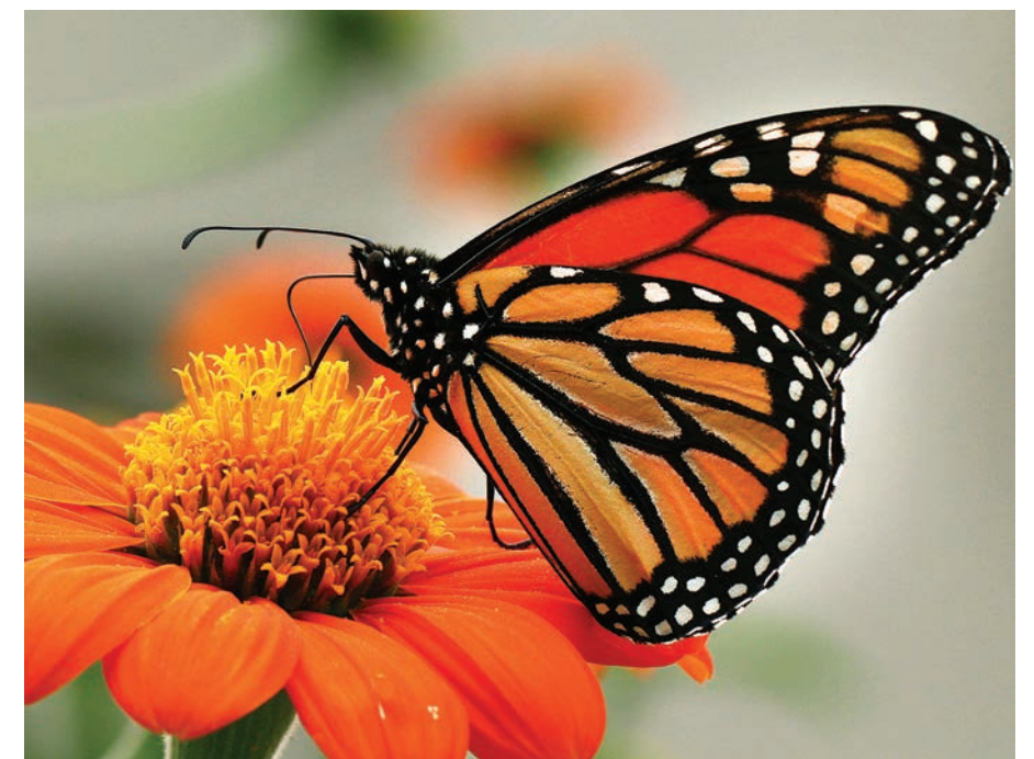
Adult monarchs are nectar feeders; the Mexican sunflower ( Tithonia rotundifolia ) above is one of many nectar sources for the butterflies that gardeners can easily include in their landscapes.

In two weeks of feasting on milkweed, the monarch caterpillar grows over a thousand times larger, and is ready to move on to adulthood. It builds a chrysalis on the underside of a milkweed leaf and dangles