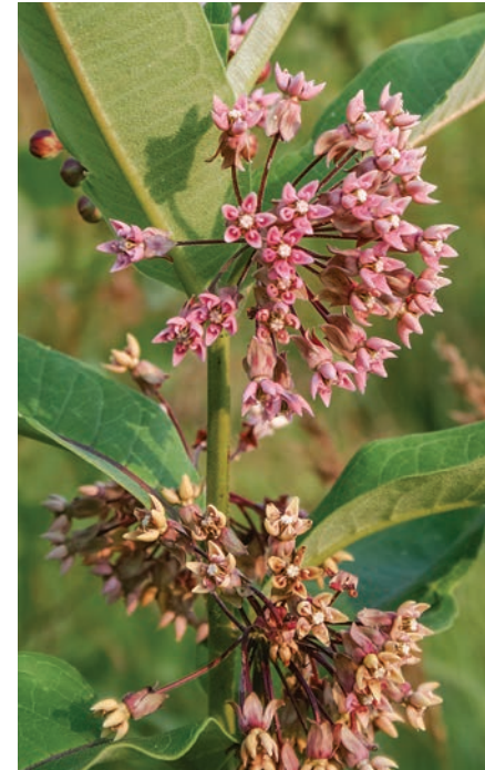
Common milkweed ( Asclepias syriaca ) is one of several species of milkweed upon which monarch caterpillars feed.

Few farmers probably mourned the loss of a plant whose name, after all, includes the word “weed.” But until recently, many Midwest farms still included milkweed in field margins and areas left intentionally unplanted under the USDA’s Conservation Reserve Program (CRP). Thanks to ethanol mandates and other factors, however, corn prices have risen so high that farmers have taken millions of acres out of the CRP. A paper published in the Proceed-