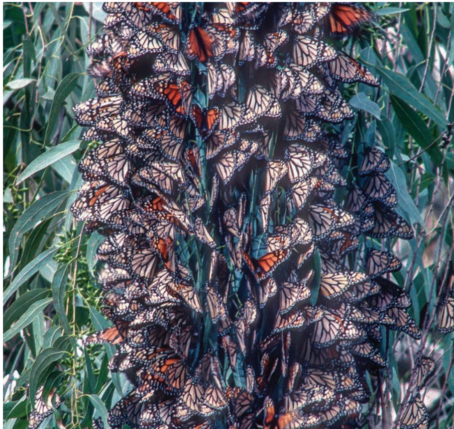
During migration, monarch butterflies rest at night in groups called roosts. Here a roost congregates on a eucalyptus tree in Pacific Grove, California.

Then there’s the butterfly itself, perhaps its own best advertisement. “This is one of our largest and most conspicuous insects, it’s very colorful, it’s slow mov-