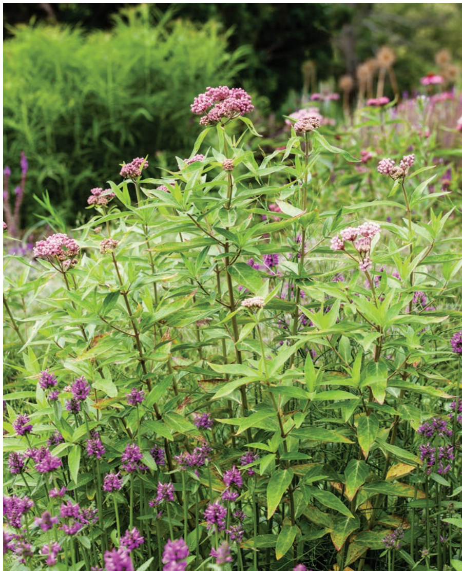
The perennial swamp milkweed ( Asclepias incarnata ) is both a monarch caterpillar host and an attractive garden plant; its flowers appear from midsummer to early fall.

Although there is undeniable logic to growing native plants to support a native insect, plants do not need be native to sustain monarchs. "The zinnia's not a native plant, but it's a good plant, and it's attractive not only to butterflies but to gardeners," Taylor says. Other garden-worthy plants that serve as nectar sources include: buddleias, lilacs ( Syringa spp.), sweet alyssum ( Lobularia maritima ), impatiens, scabiosa, and marigolds ( Tagetes spp.), to name just a few.