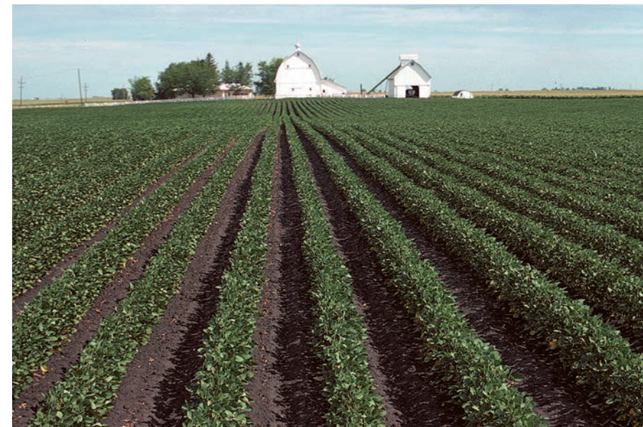
Herbicides often used in the large-scale production of soybeans, above, and corn, have drastically reduced wild stands of milkweed, which is a critical component of the monarch's life cycle.

Oberhauser and other scientists who study monarchs are quick to point out the greater significance of these findings: the