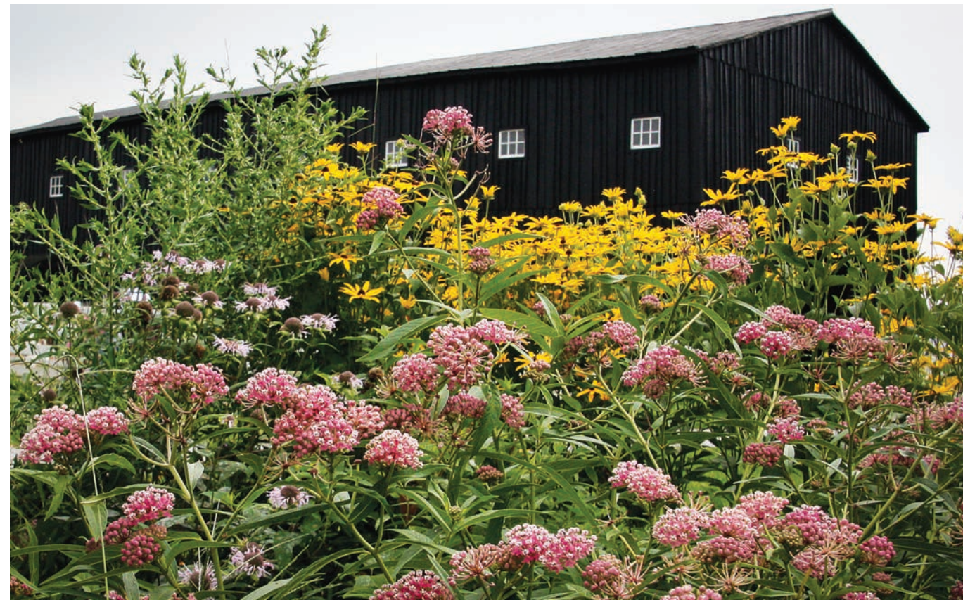
This butterfly waystation at Shaker Village in Harrodsburg, Kentucky, includes milkweeds as well as a variety of nectar plants.

Other conservation organizations not exclusively focused on the monarch butterfly have recognized the insect's potential to highlight their causes. The North American Butterfly Association has a certification program that covers habitat for all butterflies, and Wild Ones just launched a monarch-specific certification program for gardens planted with species native to North America. The Xerces Society, which focuses on invertebrate conservation, has certified more than two thousand gardens as "pollinator habitat." (For tips on creating monarch habitat, see the sidebar on page 21.)